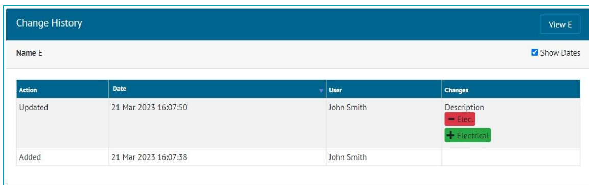
Figure 3. The History page for a Discipline

On the History pages, the 'Show Dates' checkbox is now ticked by default, meaning that the exact date and time at which each change was made is shown initially. Untick the checkbox to show it in "2 days ago" format.